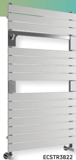
ECSTR3822 in Mineral White

A convenient swing-out arm completes the design, blending style with practicality for effortless hanging and removal.