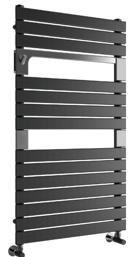
ECSTR3822 in Anthracite